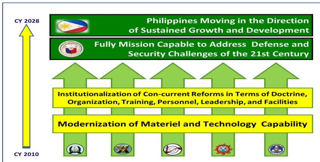
Figure 3: Conceptual Framework Philippine Defense Transformation Program

Synchronizing the attainment of the foregoing capability development goals through the Philippine Defense Transformation (PDT) Program will move the entire DND forward as one organic whole, with each of the five separate but inter-related bureaus developing in concert with each other and complementing one another. Towards 2028, the DND is envisioned to be “Fully Mission Capable” in addressing the evolving defense and security challenges; truly contributing to the aspirations of the Filipino people for the country to move in the direction of sustained growth and development.