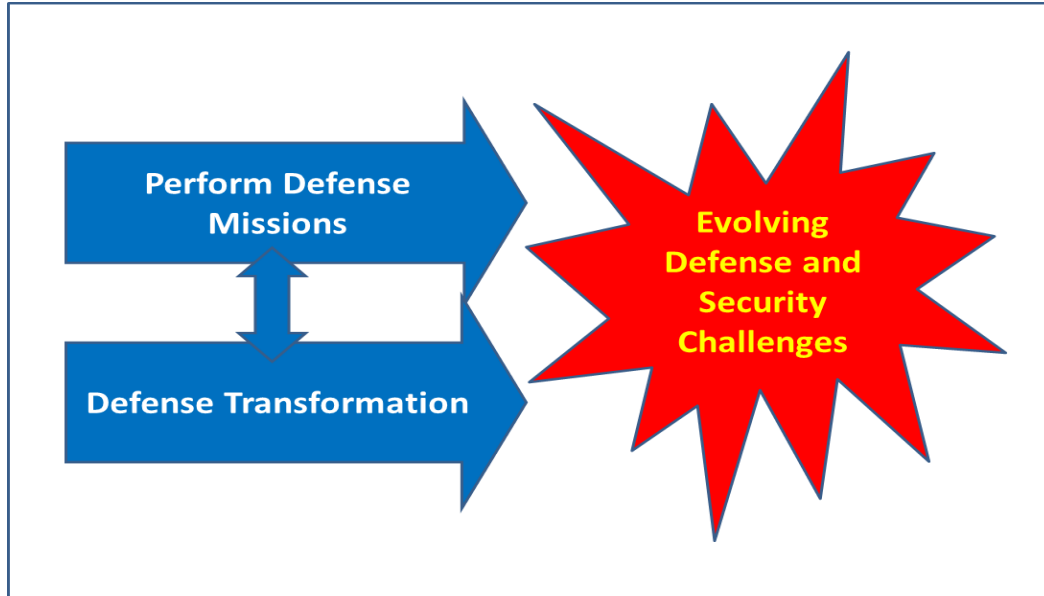
Figure 1: Major Thrusts of DND in Addressing the Evolving Defense and Security Challenges

that the Department of National Defense (DND) shall be maintained to maximize its effectiveness for performing its mandate, a policy declaration under EO 112, s-1999.