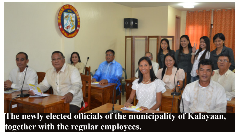
The newly elected officials of the municipality of Kalayaan, together with the regular employees.

The successful turn-over ceremony was a result of the series of meetings and preparation by the Local Governance Transition Team which was organized to facilitate