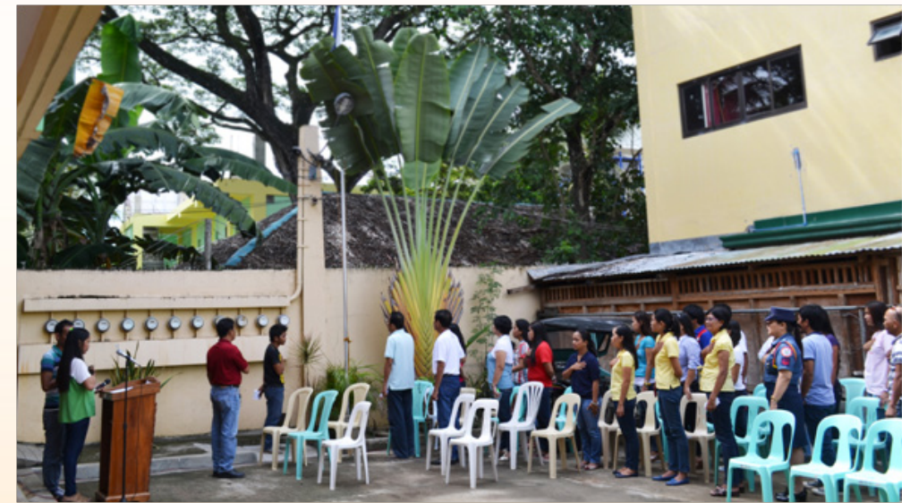
Pambungad na panalangin sa paggunita ng ika-35 Anibersaryo ng pagkakatatag ng Kalayaan.

Binigyan din ng diin ang pagahalintulad sa isang bayani ng bawat mamamayan at kawani ng Munisipyo dahil ang pagtawid lamang sa napakalawak na karagatan patungong Isla Pag-asa ay maituturing na napakalaking simbolo ng katapangan. Tinalakay din ang kahalagahan ng pagsunod sa mga polisiya na ipanatu-tupad ng mga nasa katungkulaat at ang paggalang sa mga itinalaga ng Diyos na maging pinuno ng bayan. Naikumpara din ang mga pangyayari sa nakalipas na panahon sa ilalim ng kasalukuyan at mga