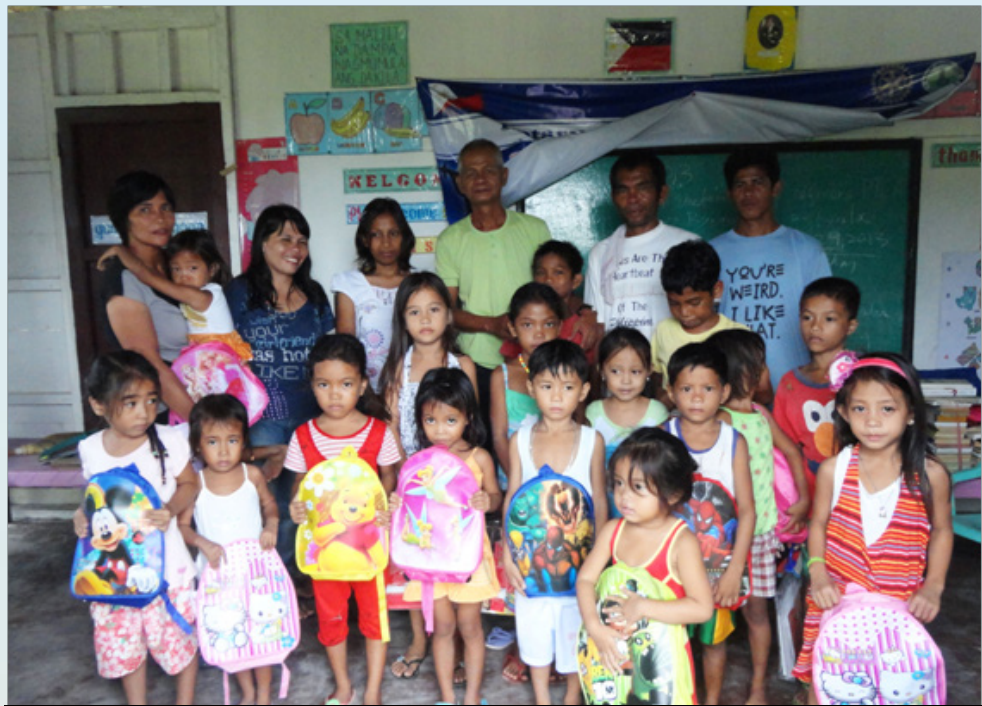
The Pupils of Pag-asa Elementary School as they receive the bags donated by the Rotary Club.