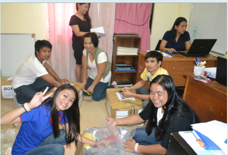
The Kalayaan Admin Staff while unpacking and checking the numbers of the donated items from theTimawa Group and "I Support Pag-asa Facebook Group."