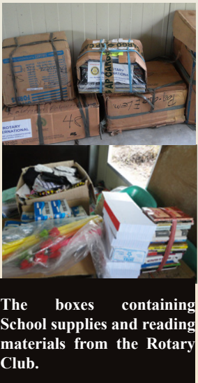
The boxes containing School supplies and reading materials from the Rotary Club.