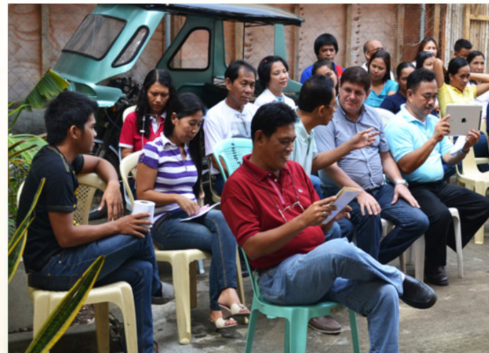
Ang mga empleyado ng munisipyo ng Kalayaan habang naghihintay sa pagpapatuloy ng programa.